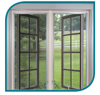
Window above shows standard screen on the left versus Clear Advantage screen on the right.

frame. Clear Advantage is also available in a kit which includes screen, spline and an installation tool to upgrade the screen in an existing door or window frame.