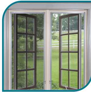
Window above shows standard screen on the left versus Clear Advantage screen on the right.